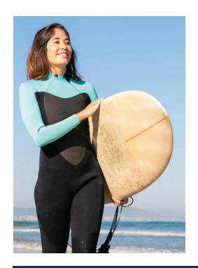
Super guarantee increasing to 12%... cont

This is great news for workers, because more super means more savings for retirement, and that can make a big difference later on.